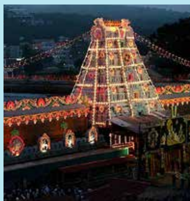
For culture seekers