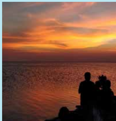
For nature lovers Pulicat Lake & Bird Sanctuary