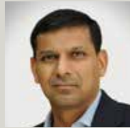
RAGHURAM RAJAN 23rd RBI Governor