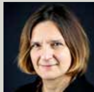
ESTHER DUFLO Nobel Laureate and Co-Founder and Co-Director, Abdul Latif Jameel Poverty Action Lab (J-PAL)