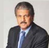
ANAND MAHINDRA Chairman, Mahindra Group